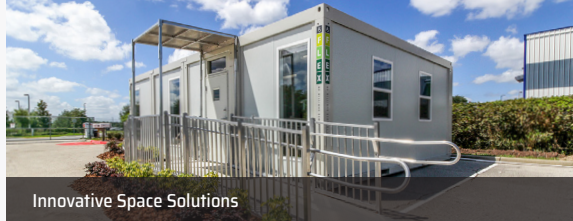
Innovative Space Solutions