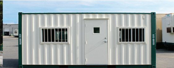
Ground Level Office Solutions